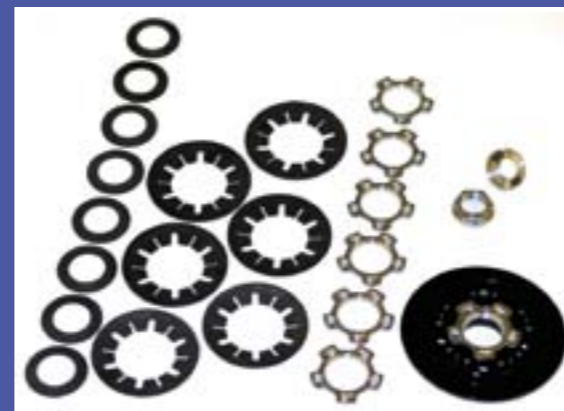
Extensive parts enable optimal tuning and adjustment.